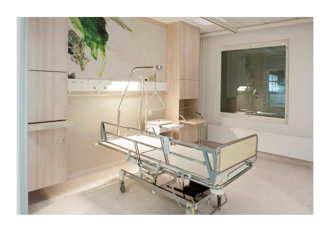
Most patient rooms are 18 m<sup>2</sup>, washrooms 6 m<sup>2</sup>