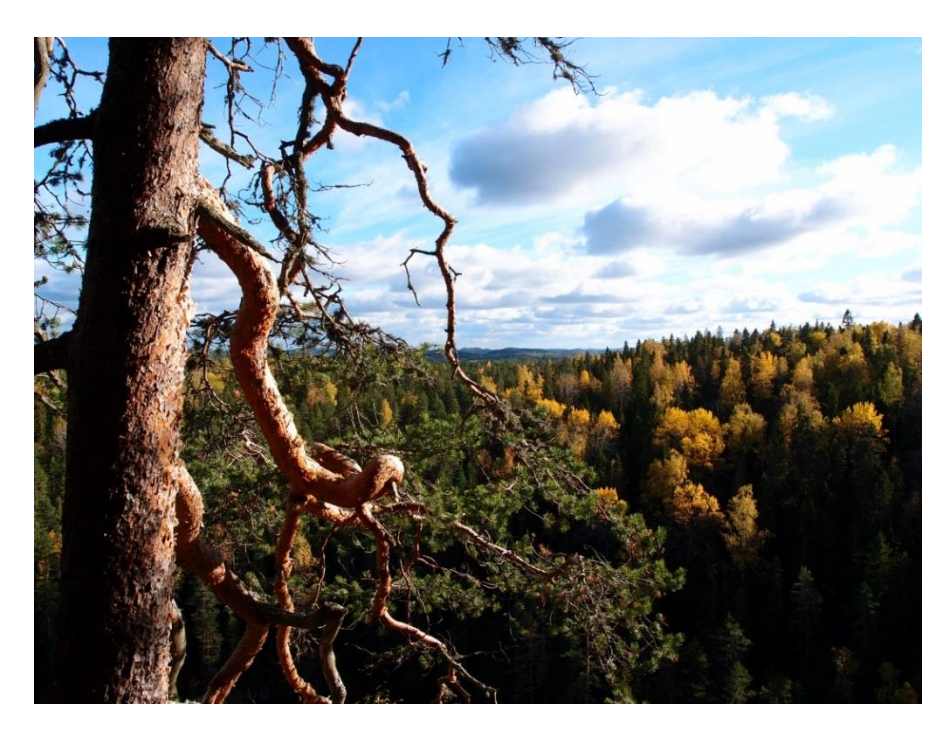
National park, South-Konnevesi